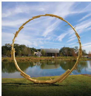
Ugo Rondinone (Swiss, b. 1963), The Sun , 2018, Bronze, stainless steel, and gold leaf, Gift of Sydney and Walda Besthoff, 2019.59

Let's send rays of sunshine from every doorstep in New Orleans!